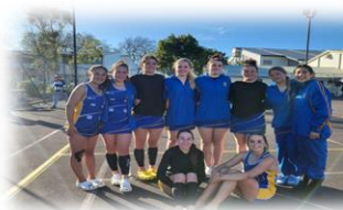
Semi Final THS – Matamata 17-18 3 rd & 4 th Playoff THS – Paeroa 18-22

Our team won two out of three pool games and made top four. We were just pipped 17-18 by Matamata College in the semi-final.