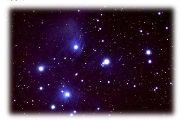
Matariki (the Pleiades)

The final programme will be sent out early next week.